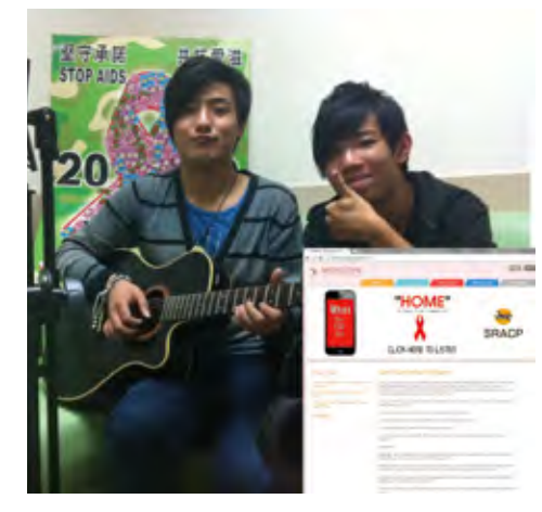
非華裔人士上載自創歌曲於服務網站,以支 持 2012 年世界愛滋病日。

An original song by a non-Chinese was posted to the service website in support of World AIDS Day 2012.