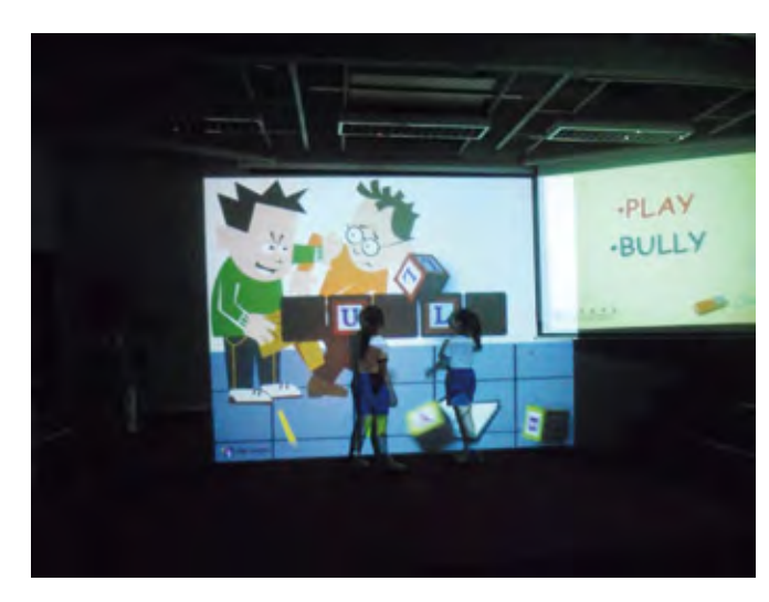
學生透過自己的影子,體驗「3D 教室」的互動創新遊戲。 Students made use of their own shadow to experience the innovative Playmotion game "3D Classroom".

As for community service, CES collaborated with the Fight Crime Committees in Wong Tai Sin, Tai Po and Yau Tsim Mong districts to organise different programmes in schools and in the community, all of which were actively involved by ex-offenders. In addition, CES had secured financial support from the Community Chest of Hong Kong to give five drama performances in Ngau Chi Wan Civic Centre, a life education theatre about family relationships. Also, we were invited by the Centre for Community Cultural Development to hold a "forum theatre" in Jockey Club Creative Arts Centre, to depict the living difficulties of ex-offenders and to arouse audiences' discussion. The "forum theatre" was later re-launched with four performances in Sai Wan Ho Civic Centre. We believed that drama could serve as a platform to bridge up offenders and the community, and thus promoting a caring and harmonious society.