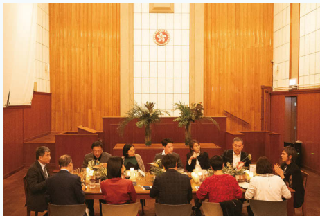
傳媒代表參與「Dining In The Court」持份者活動

Media representatives participated in the "Dining In The Court" stakeholder engagement event