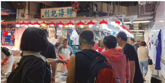
義工與宿舍服務使用者一同採購湯水材料 Volunteers shopped for soup ingredients together with the hostel's service users