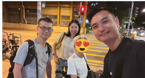
「我們仨」支持圈的義工與服務使用者遊覽社區 "Three of Us" volunteers and service users from the support network, explored the community together