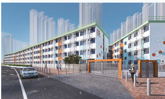
善匯外觀 Exterior of Good Mansion