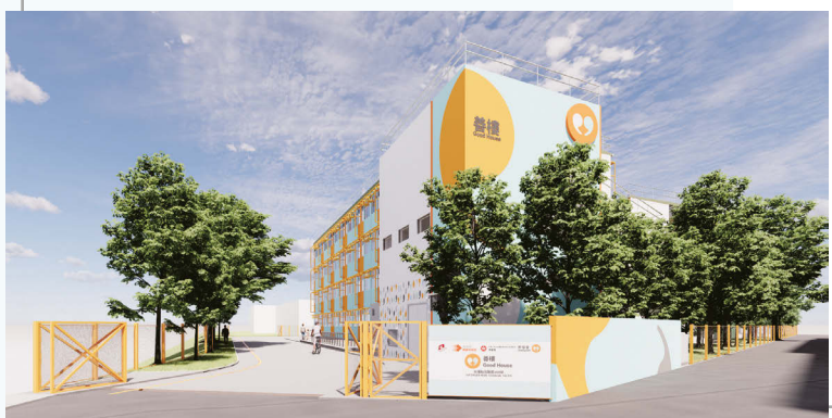
善樓外觀 Exterior of Good House