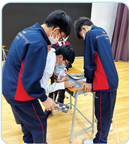
學生一同探討網絡罪行情景 Students jointly discuss cybercrime scenarios

善導會積極回應社會現況，推行預防網絡罪行的專題入校活動，以互動任務體驗模式培養學生的網絡安全意識。活動覆蓋五間中學，共約1,400名學生參與，透過辨識不同網絡罪行及陷阱，強化青少年識別網絡危機及自我保護的能力。調查顯示逾90%參加者認同活動有效提升其對網絡罪行的警覺。