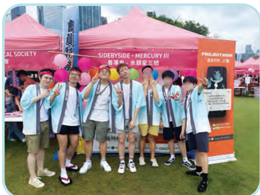
社工和朋輩支援員一同出席LGBTQ+友好活動「Pink Dot HK一點粉紅」 Social workers and peer supporters attended Pink Dot – a LGBTQ+ friendly event

計劃於本年度參與了三場大型社群活動，成功接觸了1,866位社群人士，共派發了11,631份安全套、教育宣傳品及單張，旨在提升社群的健康意識。在社工和朋輩支援員的共同努力下，我們於攤位中設計了互動式遊戲，生動地教導參與者正確使用安全套的方法，並提醒他們關於暴露愛滋病毒前/後預防性投藥的重要注意事項，減低他們感染愛滋病及性傳染病的風險。