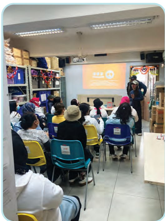
印尼領事館義工團的性教育講座 Sex Education Talk for Peduli Sehat-Hong Kong

本計劃與學校及多元族裔機構合作，一共舉辦了5次的講座，共接觸到534位人數，內容為性病預防、親密關係及身體界線等，並派發宣傳物資，以提升公眾及高危群組的預防性病意識。