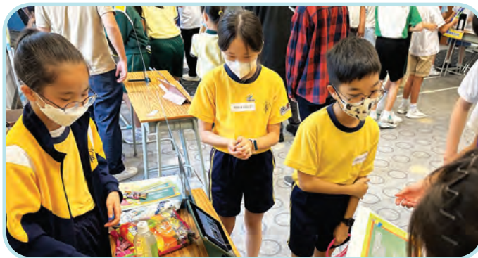
學生於嘉許禮向其他學校的和諧大使展示成果 Students showcased achievements to other schools' harmonious ambassadors at the award ceremony

This year, SideBySide launched the "Harmonious Campus Network" project in its third collaboration with the Education Bureau. Through workshops and school-based support groups, 97 students from five primary and five secondary schools were successfully trained as "Harmonious Campus Ambassadors." The project focused on anti-bullying education with the aim to enhance students' awareness of bullying behaviour and strengthen their skills in multi-perspective thinking and activity planning. These student ambassadors actively promoted a caring and inclusive culture within their schools, translating their learning into practical actions and establishing positive peer influence to reject bullying.