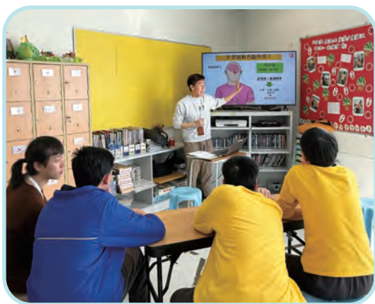
於感化/住宿院舍為青少年提供性教育小組。 Comprehensive sexuality education groups were held for the youth at Probation Home under the Social Welfare Department

感謝香港懲教署對本計劃的信任，自2025年2月18日起我們於沙咀懲教所及勵志更生中心開展為期6節的綜合性教育小組。小組旨在為青少年男性所員提供全面性教育服務，幫助他們在掌握相關知識和技能的同時建立正確的態度和價值觀，學會保護自身健康及做出負責任的選擇，同時理解並維護他人的權利，從而建立互相尊重的社會關係和性關係。小組活動深受組員喜愛，並獲得懲教署職員的肯定與讚賞，因此我們成功獲得懲教署邀請於2025年7月繼續於沙咀懲教所及勵志更生中心開展第二期「知性學堂」性健康教育小組。