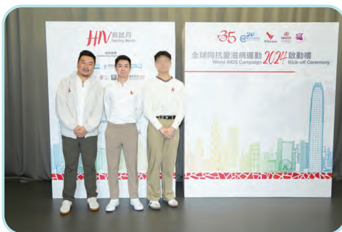
參與全球同抗愛滋病運動2024啟動禮推廣預防愛滋病感染和首個HIV測試月 Participated in World AIDS Campaign 2024 Kick-off Ceremony to promote prevention of HIV infection and inaugural HIV Testing Month

Engagement in 3 major community events this year has proven successful in reaching 1,866 individuals. Through the distribution of 11,631 condoms, educational materials, and leaflets, we aimed to raise health awareness within the community. Our collaborative effort, involving social workers and peer supporters, led to the design of interactive games at our booths. These games effectively demonstrated the correct method of condom usage and highlighted the importance of pre- and post-exposure prophylaxis (PrEP/PEP) for HIV prevention, ultimately working to reduce the risk of HIV and other sexually transmitted infections.