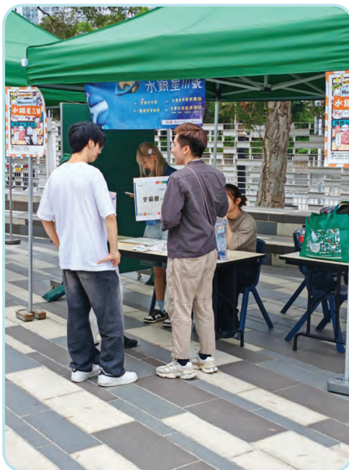
IVE大專院校的性教育攤位活動。 Sex Education Booth at IVE

This programme collaborated with schools and multi-ethnic organisations to conduct 5 talks, reaching a total of 534 individuals. The content covered STD prevention, intimate relationships, and personal boundaries, with promotional materials distributed to enhance prevention of STDs awareness among the public and high-risk groups.