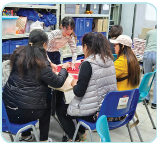
農曆新年之女性性工作者小組 Lunar New Year Female Sex Workers Support Group

近年，只持有「旅遊簽證」在本港提供性服務的女性性工作者比例上升，所以計劃加強外展工作的次數，提升女性性工作者及其顧客保護自己預防感染的意識，在全年共提供了290次外展服務及舉辦了48節性工作者小組，共接觸到4,410位性工作者及297,746位顧客。同時，亦透過網絡平台（Instagram, Threads, Telegram等），接觸服務受眾，瀏覽人次為240,934。